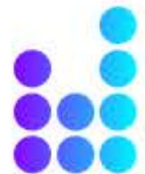
Icon on white