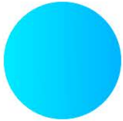
Highlight Gradient #23ADFA - #00EEFB