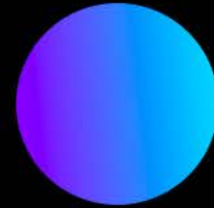
Electric Data Gradient #8A00FF - #00F2FE