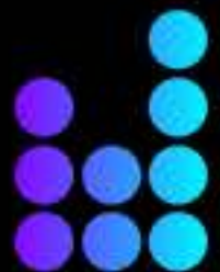
Icon on black