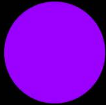
Data Purple #8A00FF