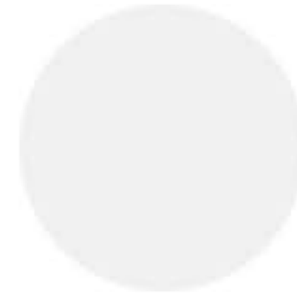
Calming Grey #F1F1F1