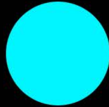
Electric Blue #00F2FE